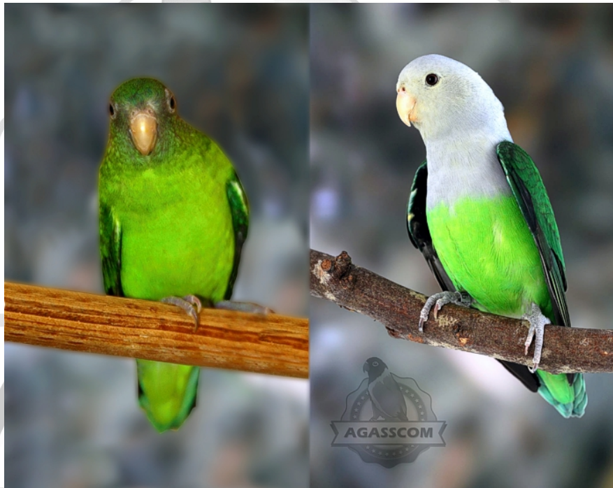
Left: female canus and male

Standard AGSC-WAC 8.1.00 Males and 8.1.02 Females